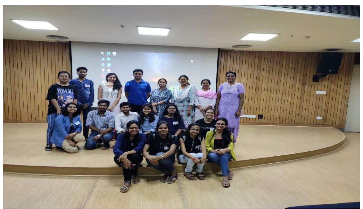
In the end of the lecture, he told us about the admission forms and encouraged all of us to join RCB and contribute to research.

It was an interactive session, we were able to put forward our queries.